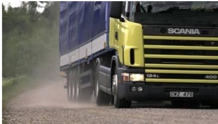
Figure 4 - New vehicles' brakes are approved and a certificate is issued stating that the legal requirements have been met.

Most drivers normally apply the brakes gently and therefore do not notice any gradual deterioration. Unfortunately, most modern vehicles require the brakes to be applied sharply every so often in order to maintain optimum performance. Some vehicle instruction books encourage drivers to brake occasionally in wet conditions to keep brakes working efficiently. There should be no such need to use the brakes to keep them working efficiently. Brakes should perform within satisfactory margins in all driving conditions.