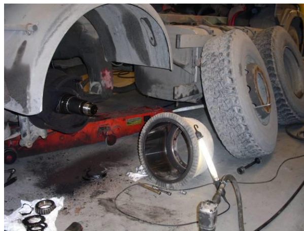
Figure 1- Maintenance of drum brakes on a heavy truck