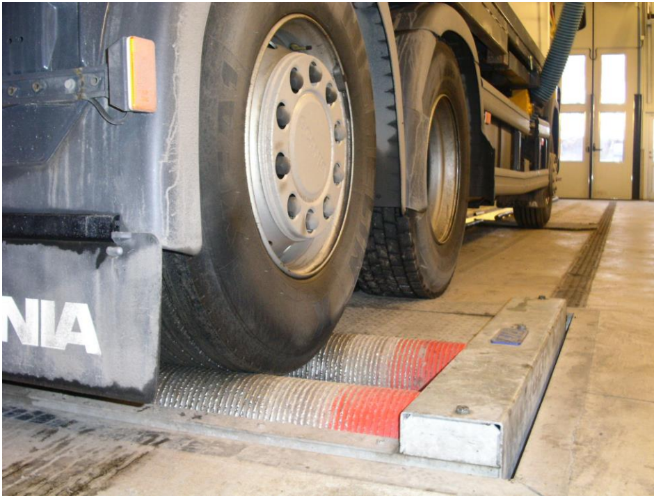
Figure 3 - Roller brake test on heavy truck

From October 2002 Supplementary Brake Testing (XTB) was introduced for heavy vehicles in Sweden. XTB involves a voluntary, supplementary annual brake test at an accredited workshop.